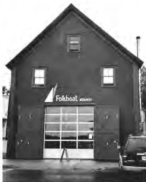
Figure 6. Folkboat Atlantic, Bluenose Drive

This brings us, finally, to the municipal agenda. A 1981 Heritage Property Bylaw provided for the protection of individual properties (although architectural controls were not adopted until 1996) and a Heritage Conservation District was established for the Old Town in 2000. 55 But with the smallest tax base, the pressure for income-generating redevelopment is greatest at the local level; and one way to ensure community support for heritage is to demonstrate its economic returns. To date,