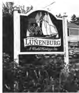
Figure 1. Town Sign, Highway 3

Lunenburg is today one of Nova Scotia’s better known heritage attractions. But to what extent is it an historic site? And how has the necessary preoccupation with tourism, use, profitability, and management—the concerns of “the modern world”—affected historical interpretation? This study discusses some of the more pressing issues in Lunenburg, especially a lack of public interpretation dealing with the colonial period. It also raises other questions such as pressures on the local economy and the environment, and a collage of governmental authorities. Throughout Atlantic Canada, communities which are designating historic districts and marketing themselves as heritage destinations are confronting similar challenges: the economic confines of being a “period piece,” the delicate negotiation of regulatory by-laws, the various demands of tourist audiences. And so a study of Lunenburg sheds light on regional issues, as it parallels circumstances in places like Annapolis Royal and St. Andrew’s by the Sea; these are all planned towns founded around eighteenth-century military fortifications, now national historic districts whose attractive colonial architecture and seaside locations make them prominent tourist destinations and sources of promotional