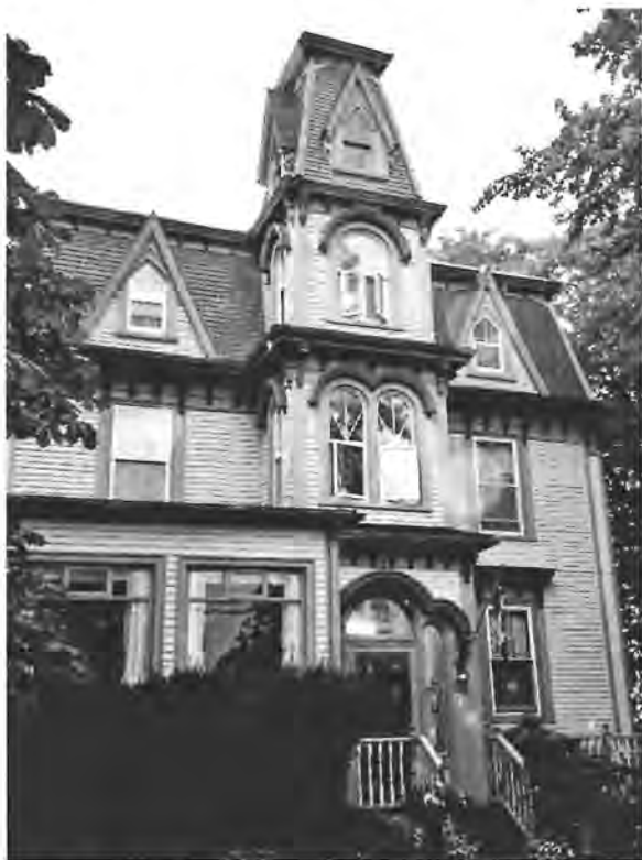
Figure 3. Bluenose Inn

With the town presenting a unified nineteenth-century waterfront and streetscape, there is a disparity between the period seen and the period prioritized in designation. This is the concern of an academic – not the concern of the town council – but it is precisely for that reason that it needs to be discussed. The waterfront evokes a romantic era of seafaring, the colourful houses an era of cosmopolitan wealth (a far cry from Ian McKay’s simple fisher-“folk”!). 28 But these Victorian artifacts are largely anachronistic to the UNESCO designation. Only about 1 percent of the Old