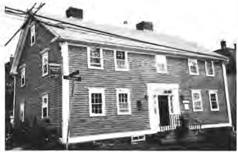
Figure 4. Solomon House

This reliance on ambiance leaves too much to commercial venues, which play exclusively to the maritime theme. Visitors may buy a model dory at one of the gift shops; have a lobster lunch at the Fishermen's Arms; walk onboard the Bluenose II ; and retire to a bed and breakfast in a converted sea captain's house. To be fair, it is easier to re-use and re-inhabit buildings of the late nineteenth century than a two-dimensional grid of the eighteenth; and one of the hard realities of