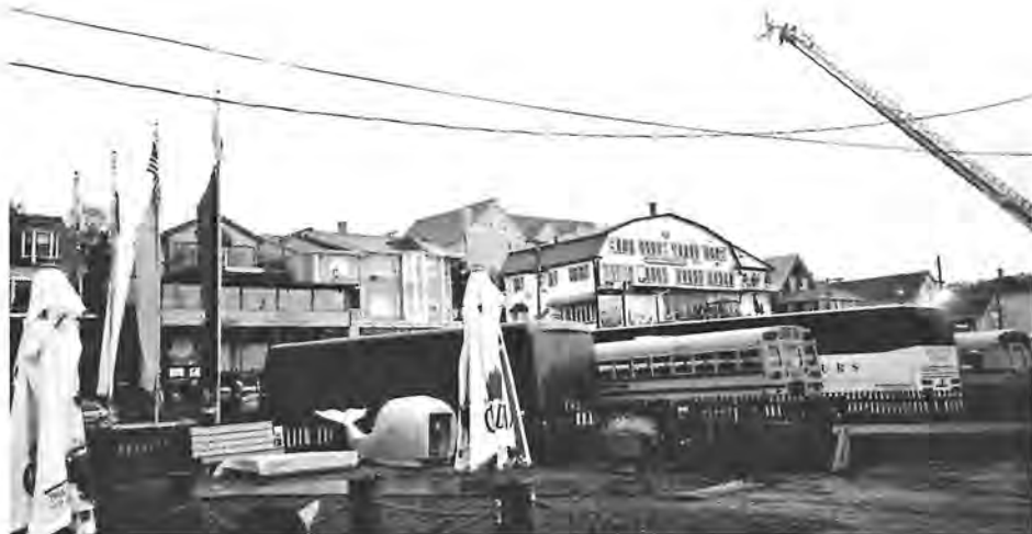
Figure 5. Fisheries Museum Parking Lot

that traffic must be controlled in order to preserve historic fabric. 43 Given Nova Scotia's poor environmental track record, Lunenburg's small scale suggests it might serve as another kind of "model town": a greener, post-industrial community. Even in 1966 the town was seen as an alternative to the prevailing practices of suburban sprawl on the one hand and downtown levellings as "renewal" on the other. There is "a scale of contact with the sea and the land behind which is missing in our larger cities and should be nurtured here," planners wrote. "It is an inspiration for our generation in creating new urban forms." 44