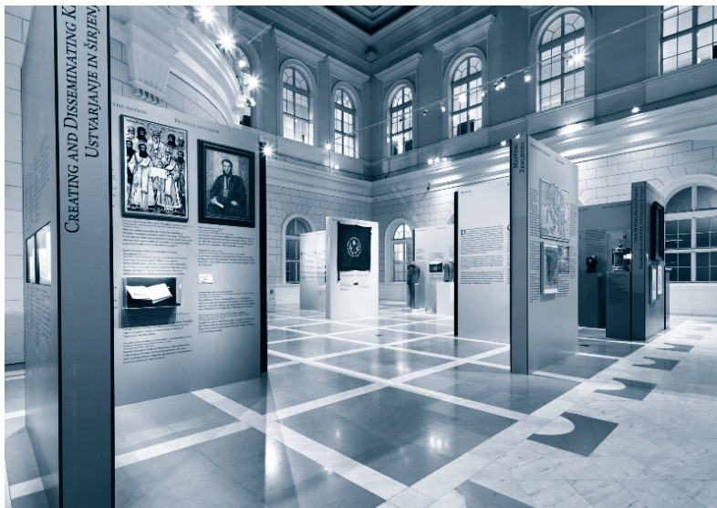
Traveling exhibition Imagining the Balkans. Identities and Memory of the Long 19 th Century was first opened in the National Museum of Slovenia, Ljubljana. Each of the 10 topics had separate movable walls on particular colours so that visitors could distinguish them both spatially and visually.

The exhibition is not a chronological overview of the long 19 th century and it is not a usual historical narrative composed of events and specific actors: it is more a storyline about certain changes and phenomena of the 19 th century with particular focus on the idea of nation-building, emancipation and modernization. It does not have a necessarily linear path that the visitor should follow, but it has a starting and ending theme that frame the rest of the eight themes discussed.