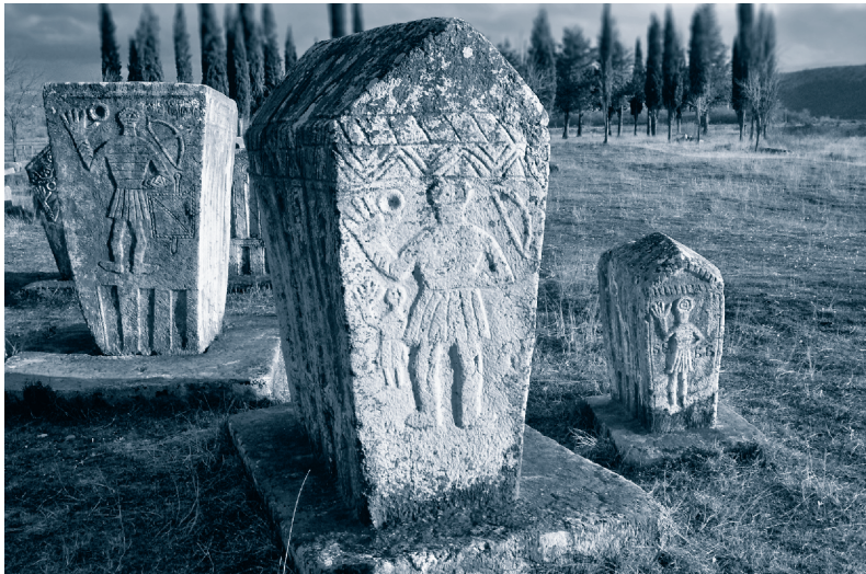
Stećaks from Radimlja necropolis, Bosnia and Herzegovina.

While Stećaks are an ideal example of shared heritage in the region, they are also the site of dissonant confrontations, different opinions and opposing views as to their archaeological, artistic and historical interpretation. These confronted interpretations coincide with the creation of nation-states and rising national awareness in the region. Researchers and historiographers from Bosnia, Serbia and Croatia have all claimed ownership of Stećaks for their national community by linking them with medieval Serbian, Bosnian or Croatian states. Medieval states through which each of today's countries legitimize ownership over certain territories. Not only in the national historiographies of these countries but also in popular science, arts and literature since the 19 th century, one can find claims of national and religious identity in relation to the medieval practice of burying one's dead under Stećaks.